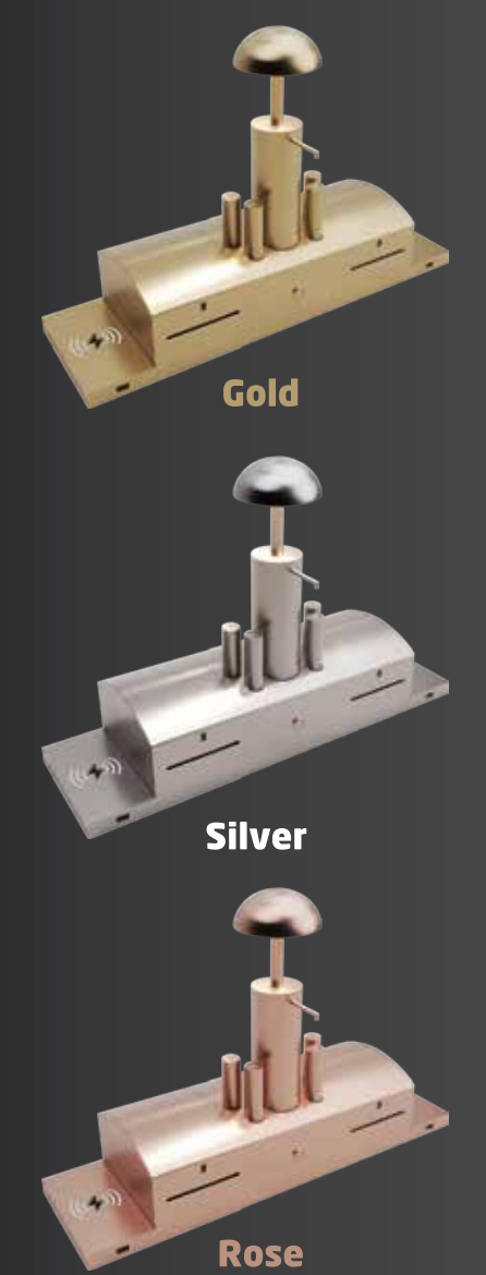
Special Coating (Optional)