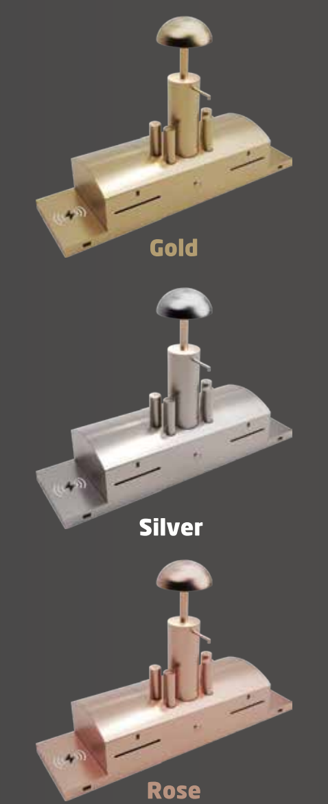
Special Coating (Optional)