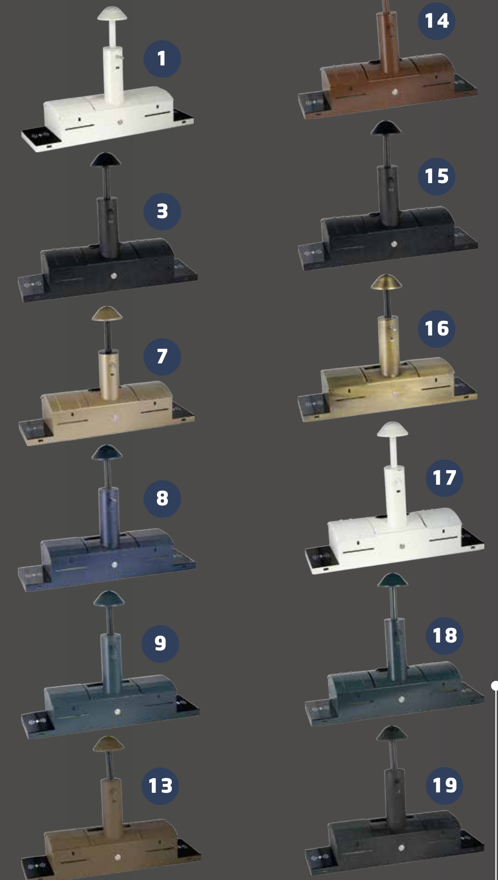
Special Coating (Optional)