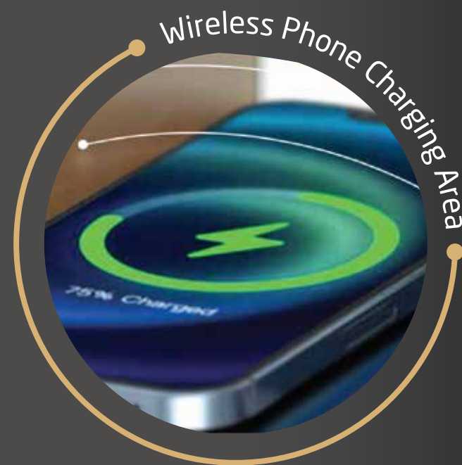
Wireless Phone Charging Area