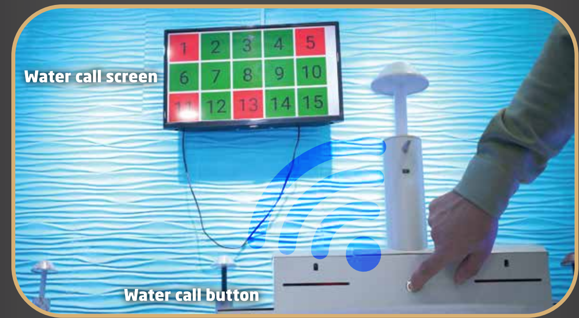
Water call screen