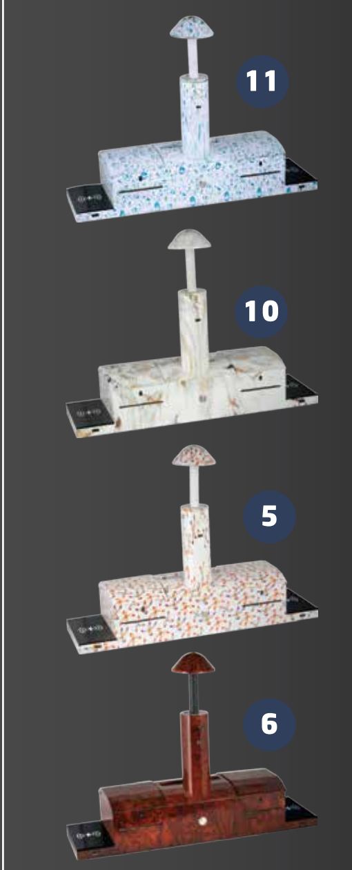
Special Coating (Optional)

You can choose special paint's (optional)