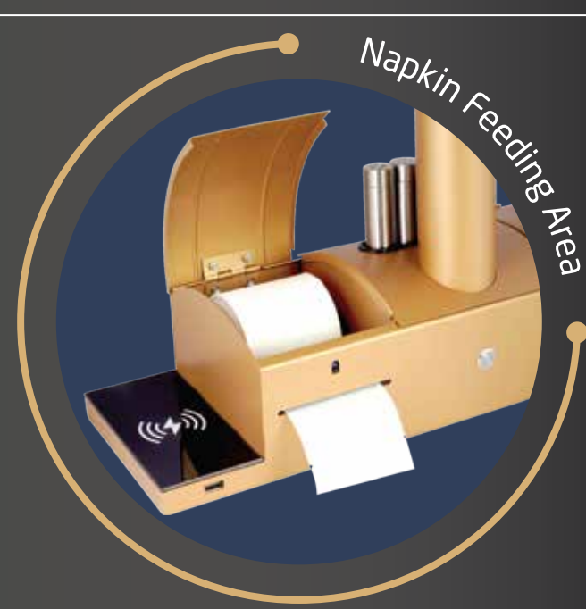
Napkin Feeding Area